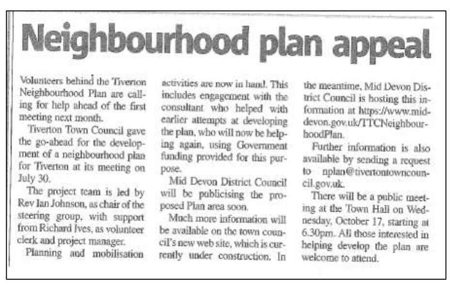
Tiverton Gazette article promoting the launch event, 2018

2.5. Furthermore, the Chair promoted the TNP and launch event via the Tiverton Community Radio<sup>3</sup>, and displays (including TV screen) were set up in the central Pannier Market and in the Town Hall foyer. An initial website for the neighbourhood plan was set up and hosted on the MDDC pages, due to the Town Council website being upgraded at the time. A dedicated email was also set up, monitored by the Co-ordinator.