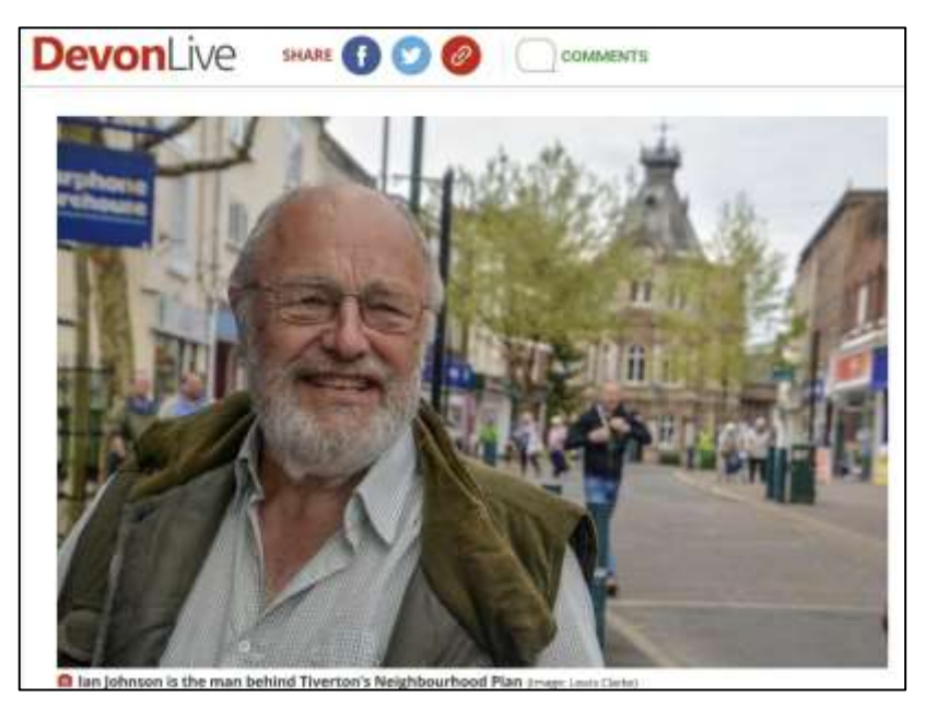
Coverage in Devon Live, September 2019

2.31. Regular communications provided to the local press including Tiverton Gazette, the Tivvy Talk newsletter, and Devon Live.