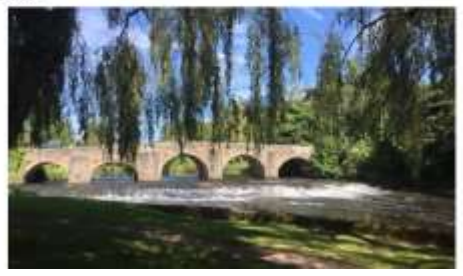
Evidence for Tiverton Neighbourhood Plan